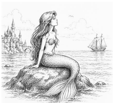
The Little Mermaid

2. Look at the images below and discuss the questions in pairs or small groups.