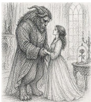
Beauty and the Beast