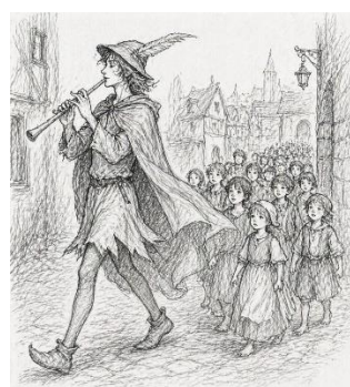
The Pied Piper