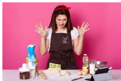
2. She dislikes cooking. (cooking)