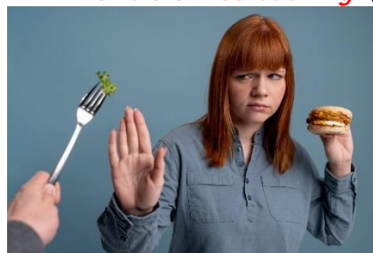
4. She hates eating broccoli. (eating/broccoli)