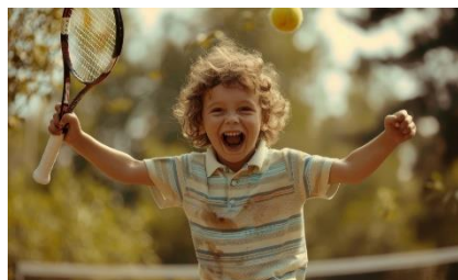
5. He loves playing tennis. (playing/tennis)