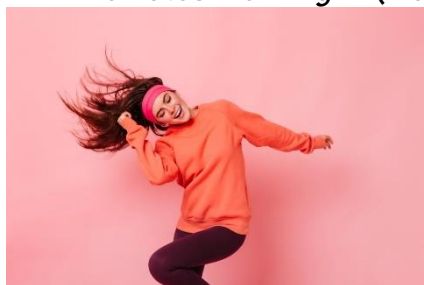
3. She loves dancing. (dancing)