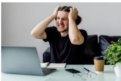
1. He hates working. (working)