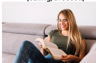
6. She likes reading books. (reading/books)