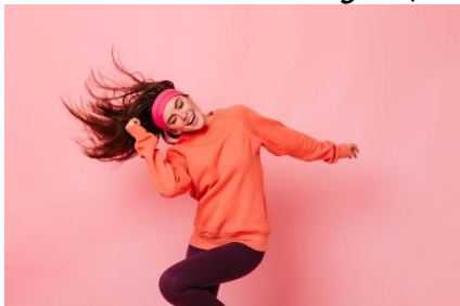
3. .... (dancing)