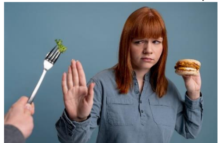
4. .... (eating/broccoli)