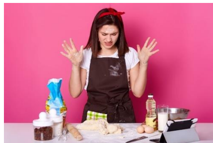
2. .... (cooking)