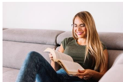
6. .... (reading/books)