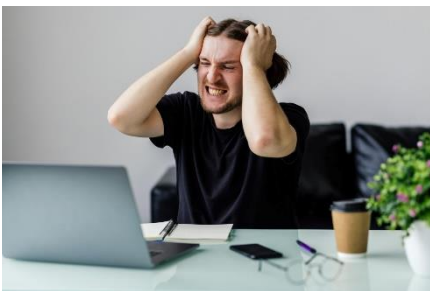
1. He hates working. (working)