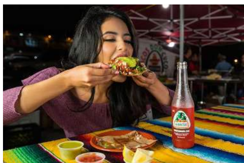
1. to eat