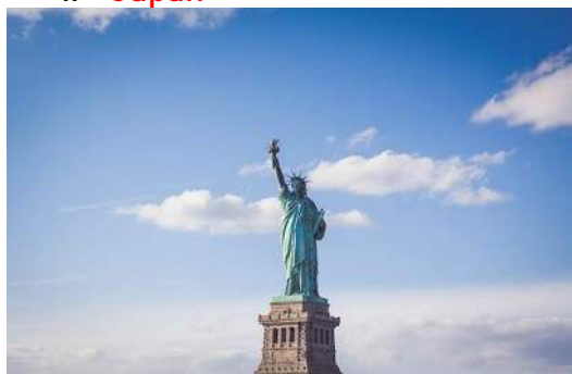
3. The USA