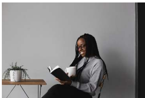
1. She likes reading.