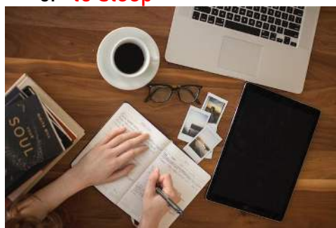
8. to write