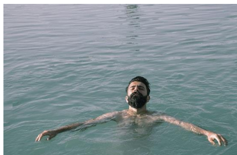
2. He likes swimming.