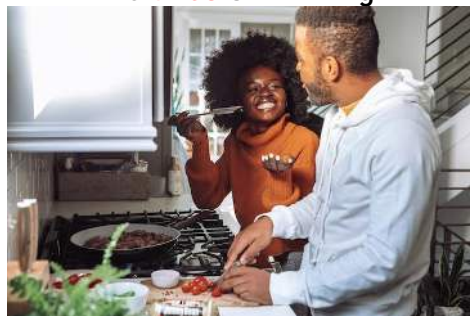
4. They like cooking.