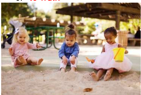
7. to play