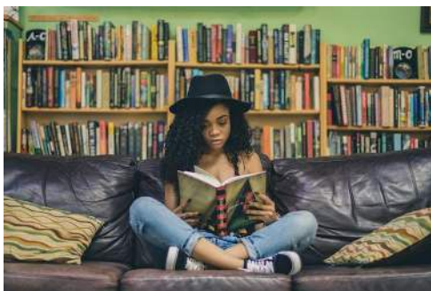
3. to read