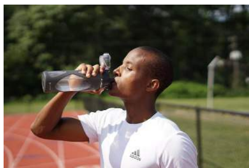
2. to drink