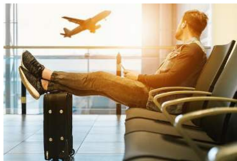
4. to travel