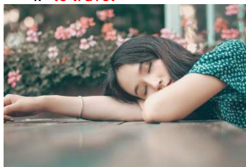
6. to sleep