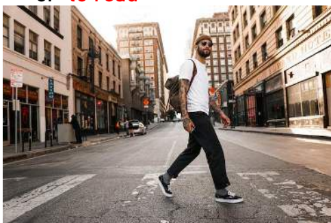
5. to walk