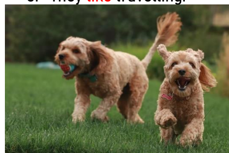
5. They like playing.