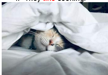
6. It likes sleeping.