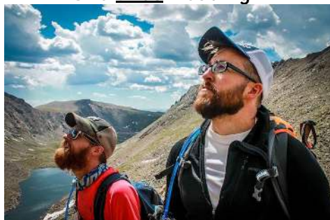
3. They like travelling.