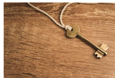
3. __a__ key.