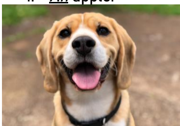
4. __a__ dog.