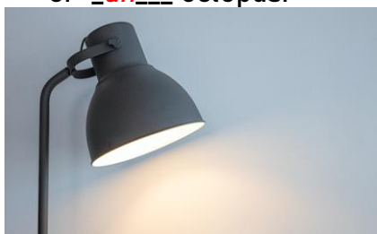
11. __a__ lamp.