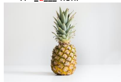
12. __a__ pineapple.