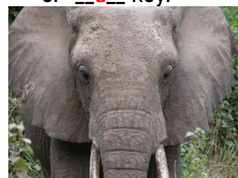
6. __an__ elephant.