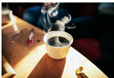
2. __a__ coffee.