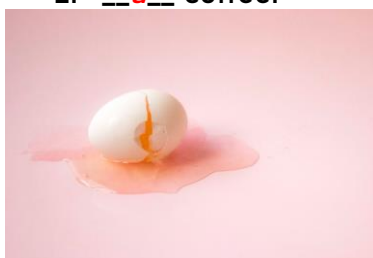
5. __an__ egg.