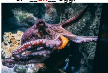
8. __an__ octopus.