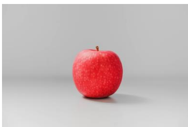
1. A n apple.