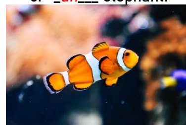
9. __a__ fish.