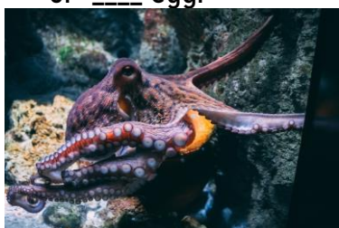
8. ____ octopus.