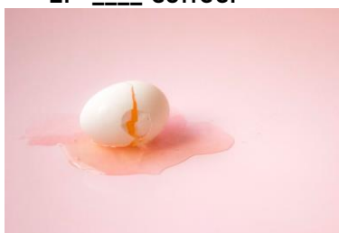
5. ____ egg.