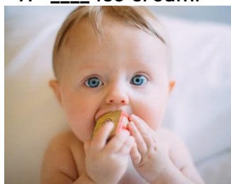
10. ____ baby.