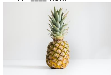
12. ____ pineapple.