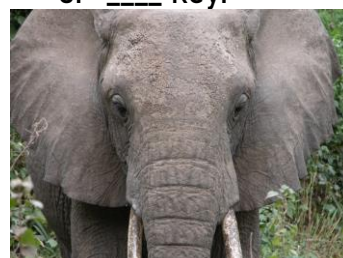
6. ____ elephant.