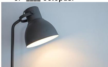
11. ____ lamp.