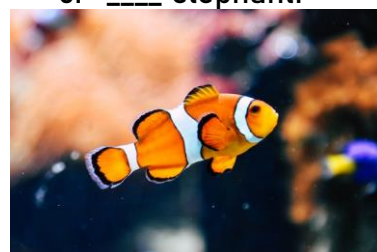
9. ____ fish.