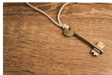
3. ____ key.