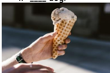
7. ____ ice cream.