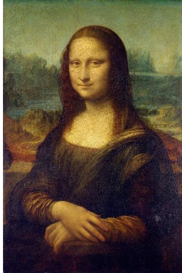
Mona Lisa $900 Million