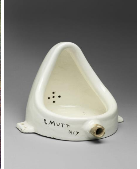
Fountain $2 Million