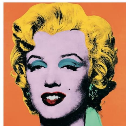
A portrait of Marilyn Monroe by Andy Warhol