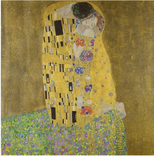
The Kiss $200 Million