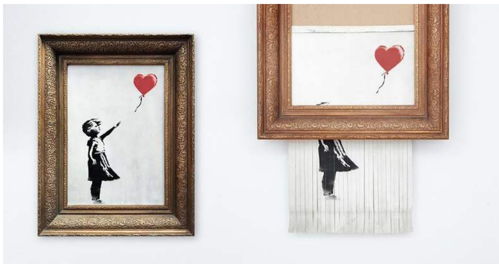
Love is in the Bin $18 Million

? Which of these artworks would you like to have in your house?