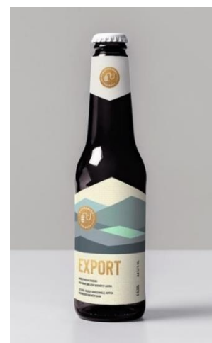
Design by Exsenz vii

In recent years, easily the most popular packaging trend has been minimalism. But there are many types of minimalism, and one that has been increasingly popular is simplified geometry. Bold, colourful shapes can have the design elements of abstract modern art, while still giving the consumer an idea of what the product is, and what it stands for. If done right, this style will leave a lasting impression, and give your brand the edge in the marketplace.