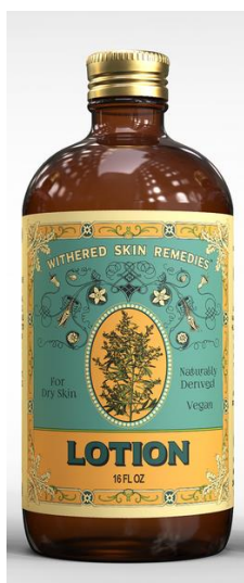
vi