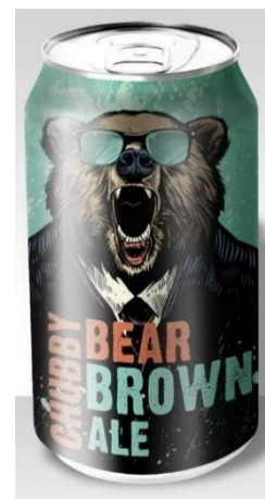
Design by Drawziart v

Storytelling is an essential part of any successful marketing campaign, and one of the most direct ways to achieve this is with quirky and eye-catching characters. These bold and distinctive mascots can quite literally fill your branding with character, and are one of the most effective ways of making different products from the same product range easily distinguished.